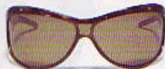
BOTTEGA VENETA Tortoise mask glasses, $300 (877-362-1715)

L.A. is funky, New York sophisticated. But geography isn't destiny. The way you dress is really a state of mind