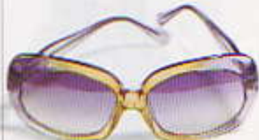
TRINA TURK Monterey glasses, $168 (trinaturk.com)

Colored lenses deflect glare and attract attention. Ready for your close-up?